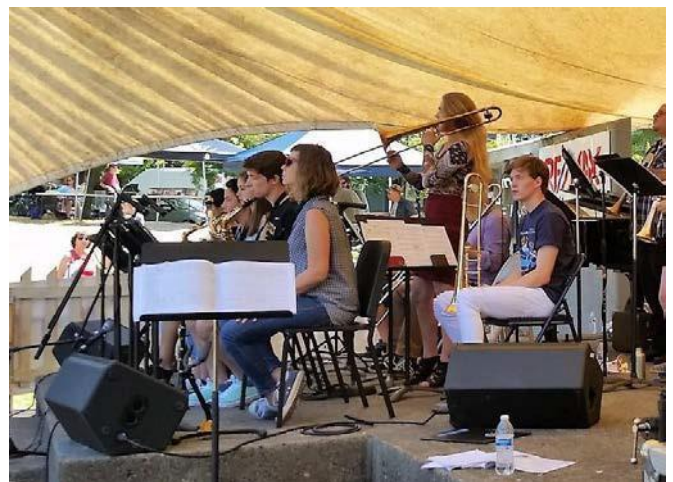
Roosevelt High School Jazz Band